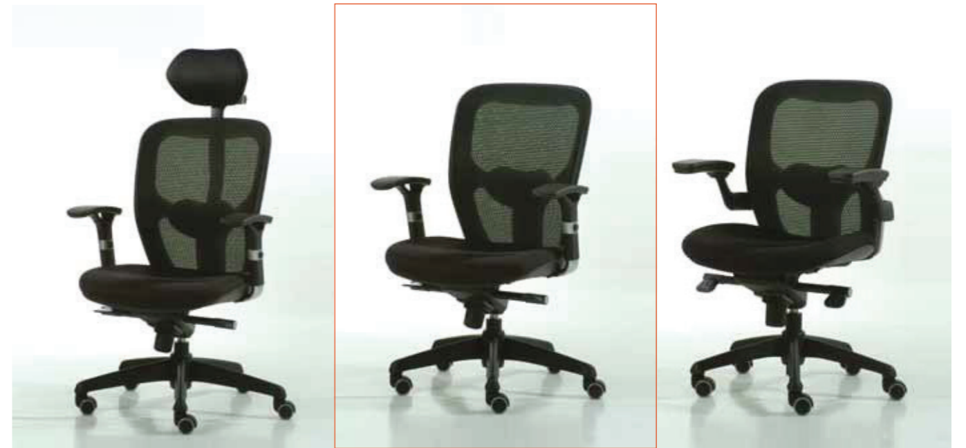
QM1 (Adjustable armrest)

Backrest uses high tenacious mesh material that provides better air circulation, support and comfort.